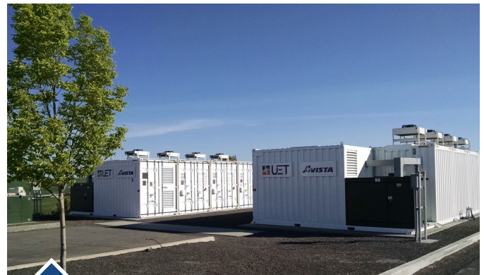
Utility-scale batteries can help integrate renewable energy into the grid.

America can achieve a 100% renewable energy future by tapping our abundant clean energy resources, maximizing energy efficiency, and adding flexibility to the grid. Energy storage technologies like batteries can play a critical role in smoothing the deployment of renewable energy by storing excess clean energy for later use.